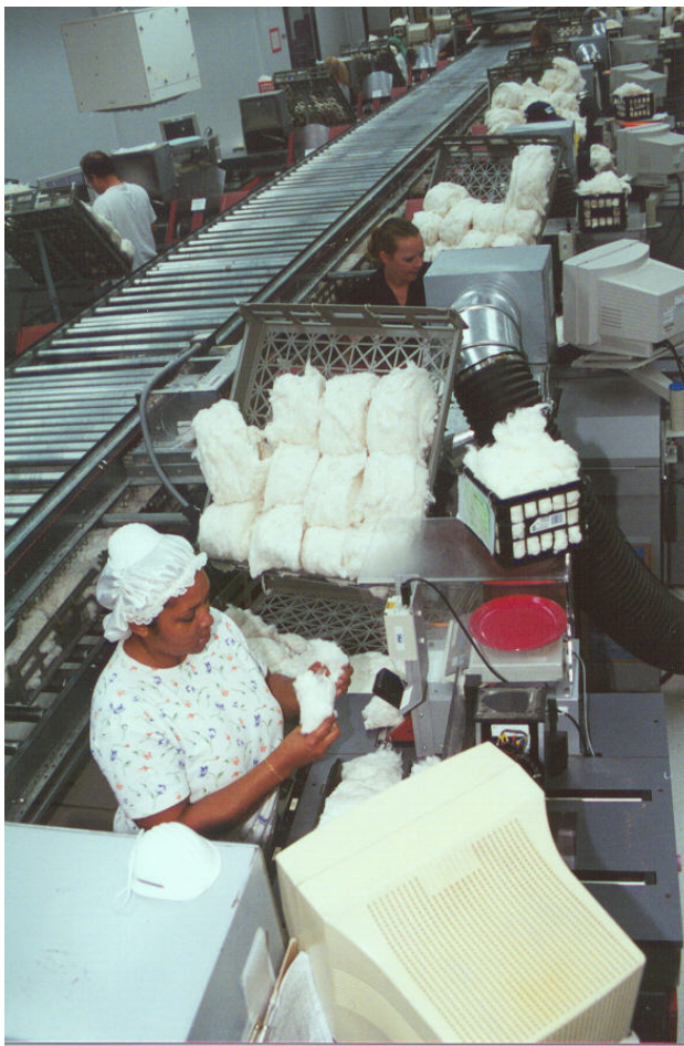
Utilizing the latest technology and equipment, samples are classed on an assembly-line arrangement with fiber measurement results electronically transmitted to the classing facility's computerized data base.