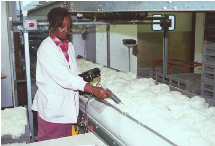
Upon arrival at the USDA classing facility, samples are conditioned to standardize moisture content before the classing process begins.

The moisture content of the conditioned samples is checked to verify that the appropriate moisture content has been reached. The moisture content of the samples to be tested should not vary more than one percentage point from the moisture content of the calibration cottons.