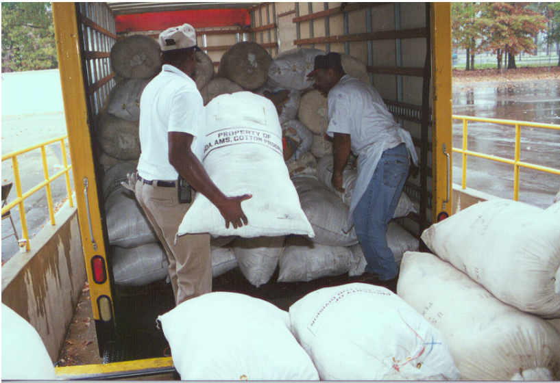
Samples are collected from sampling points, usually on a daily basis, and delivered to the USDA classing facility serving the area.

Cotton classification data are available to producers or their authorized agents through computer-to-computer telecommunications, diskettes, tapes, and computer-generated printed documents. The most popular method of dissemination is telecommunications, because it gives the customer immediate access to data upon classification. The data are available to subsequent owners of the cotton, primarily merchants and manufacturers, through a computerized central data base. This data base is accessible by telecommunications and contains classification data for the current and past year's crop. Access to the classification data is limited to the current owner of the cotton.